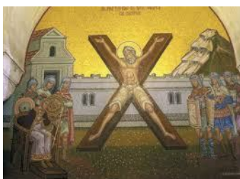
Crucifixion of St. Andrew

In the year A.D. 62 Saint Andrew was crucified at Patras, Greece, on an X shaped cross.