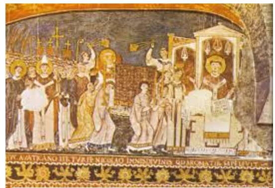
Return of the Relics of Pope St. Clement, Fresco in St. Clement Basilica, Rome. Pope Adrian II is depicted on the left wearing the papal tiara and flanked by Ss. Cyril and Methodius.

Saints Cyril and Methodius were summoned to Rome by the pope who wished to question the introduction and use of the vernacular Old Slavonic in worship within his patriarchal territory. Pope Adrian received them and listened to their presentation, approved the books, had the Slavonic Gospel enthroned on the altar of the Basilica of Saint Mary Major, and directed Saint Cyril to offer the Divine Liturgy in Slavonic. Although St. Cyril died in Rome, the pope appointed St. Methodius as papal legate, and he returned to labor in the vineyard, establishing new dioceses but he endured imprisonment and persecution.