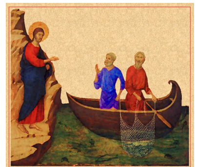
Call of the brothers: St. Andrew, first called, and St. Peter, the head of his College of Apostles.

There he established a church in the years A. D. 36 to 38 and appointed Saint Stachys as the first bishop of Byzantium.